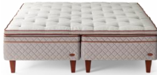
DUX classic frame bed with natural latex top pad.

Many DUX customers have had their bed forever, long after our warranty or normal usage, without care. We believe the ability to to change parts, renew or restore our products, helps that long-lasting effect, unlike any other product. We guide the customer on caring for their bed so that even after the 20-year warranty is over, no problems.